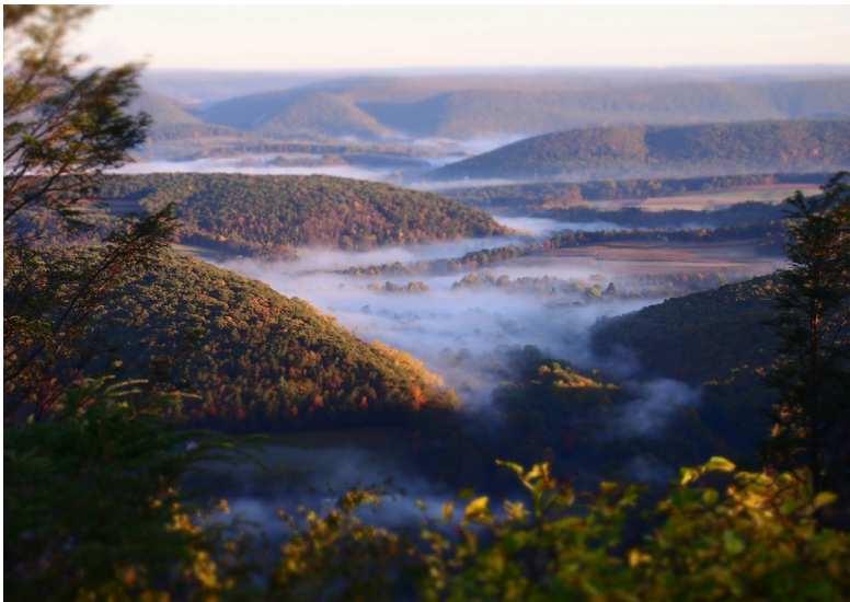
The Kittatinny Ridge is the gateway to Pennsylvania's Ridge and Valley Region.