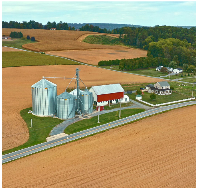
Agriculture is a key land use in the KRSL, especially in its valleys, where there are prime farmlands.

Rapid population growth and development around the Kittatinny Ridge Sentinel Landscape’s main highways have decreased open space and increased light pollution, threatening FTIG’s nighttime training capabilities. These pressures impact military installations specializing in Air and Missile Defense; sensitive species, like the eastern regal fritillary butterfly and cerulean warbler; ecosystem services, including drinking water, farm products, and timber; recreational resources; and climate change resilience. Currently, only 20 percent of the Kittatinny Ridge Sentinel Landscape is protected, which has attracted a myriad of partners to collaborate on strategic actions aimed at protecting the natural resources of this landscape.